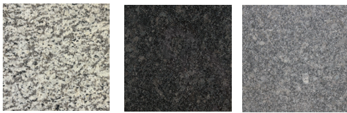
Siberian White Black Pearl Slate Gray