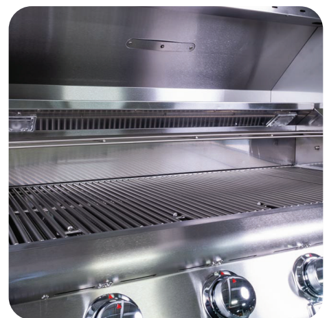
STAINLESS STEEL APPLIANCES